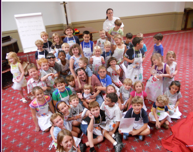
August 2011 "Taste and See: God is Good" Vacation Bible School at Bruton Parish.