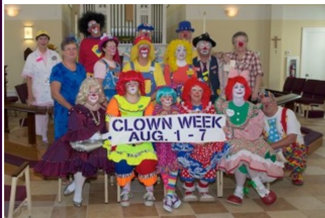
The 11th annual Blessing of the Clowns took place at the 9:00 a.m. service on August 7 th, with the Kolonial Klowns of Williamsburg, Clowns of America International – Alley #357, well represented at the service. A reception in the Wilkinson Center, hosted by Kolonial Klowns of Williamsburg, followed the service.